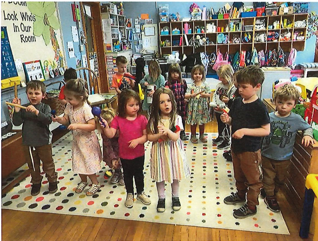
The children playing instruments to the music “Celebration.”

Another thing completed for the month was Catechesis of the Good Shepherd which they enjoyed very much.