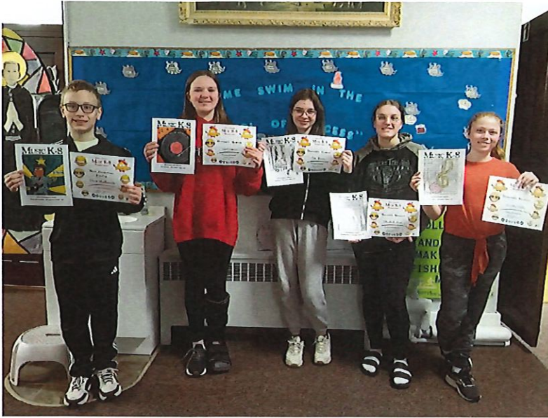
Music K8 Cover Awards