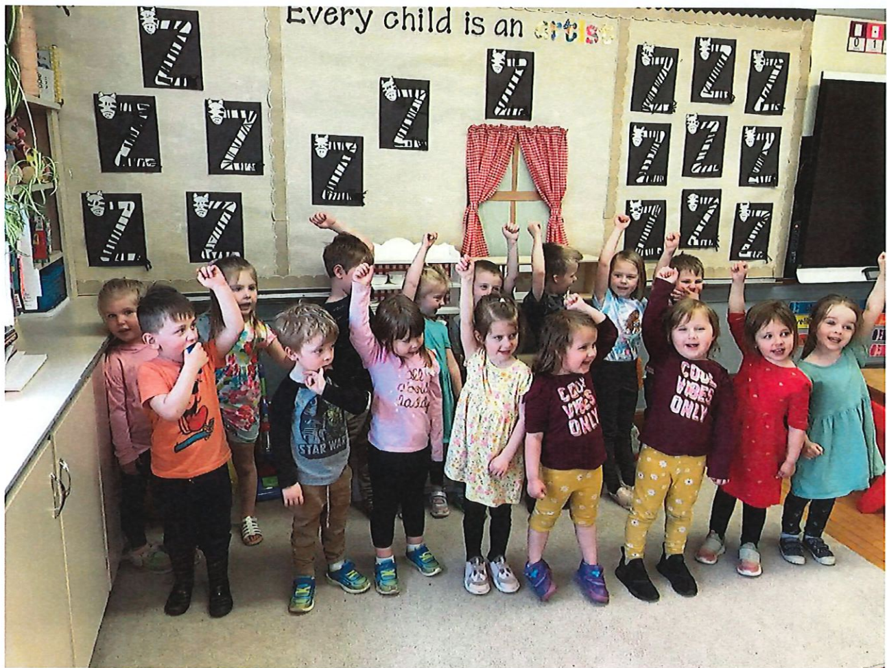
3K students saying "Hooray we learned all our ABC's!!" Their zebra artwork is hanging on the wall behind them.

We concluded our month with our final letter of the alphabet the letter Z hearing stories about different animals in the zoo and making a zebra out of the letter Z. We now completed the entire alphabet and of course had to celebrate! We had zebra cakes and played our instruments to the song "Celebration."