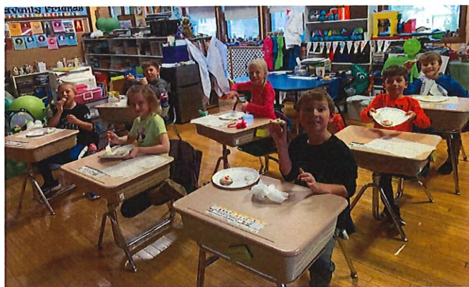
decorating shortbread cookies with roses to celebrate St. Elizabeth of Hungary →→→→→